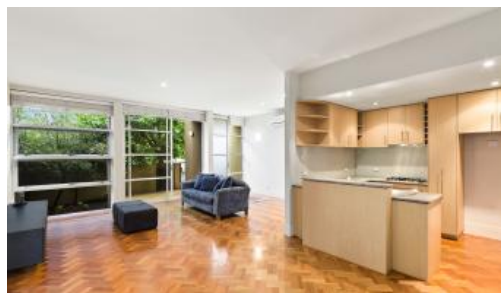
Townhouse 1, 307-309 New Street, Brighton