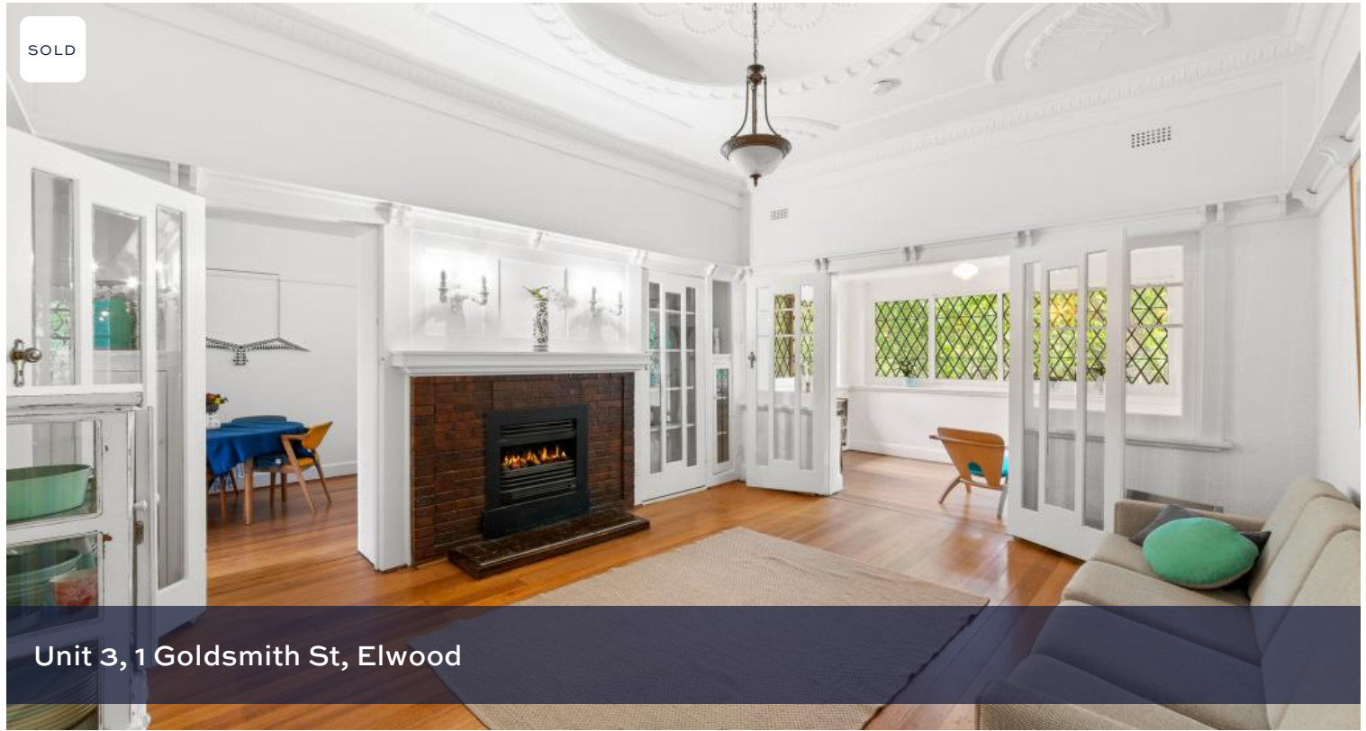
Unit 3, 1 Goldsmith St, Elwood